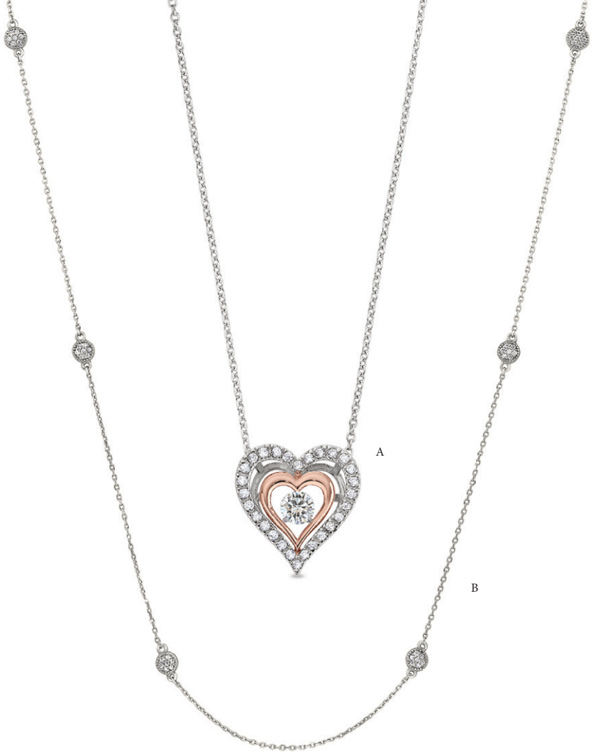
A. Platinum & rose gold finished sterling silver dancing stone heart pendant with simulated diamonds. $149.95 B. Platinum finished sterling silver tin cup necklace with simulated diamonds. $139.95